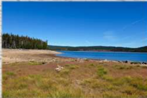
FOURMILE LAKE 2025