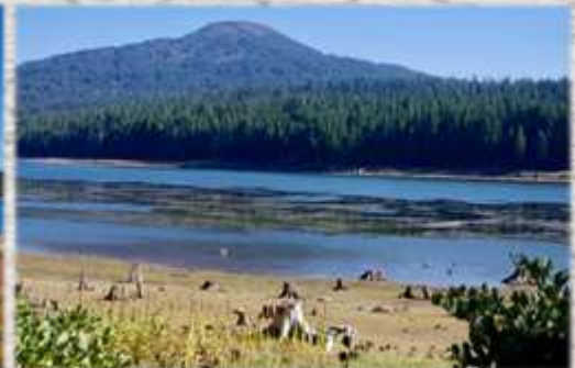
FISH LAKE 2023