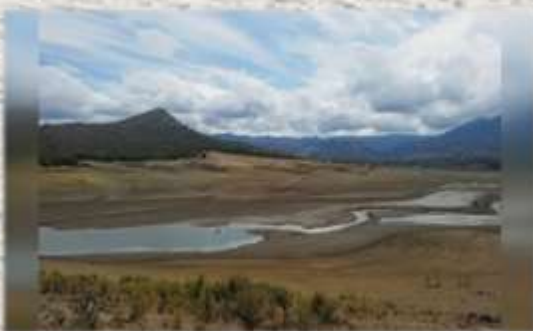
EMIGRANT LAKE 2020