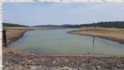
HYATT LAKE 2021