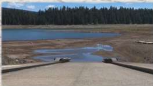
HOWARD PRAIRIE LAKE 2020