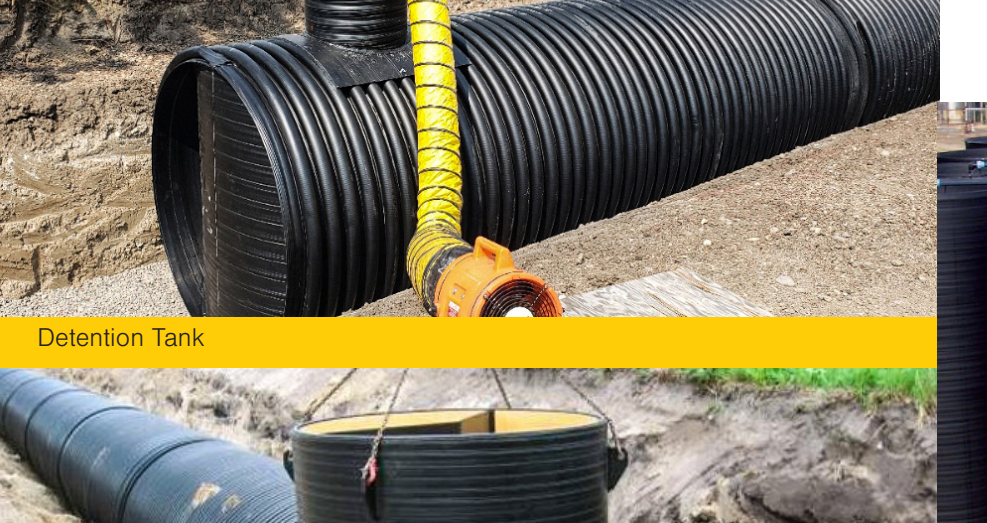
Stormwater Retention Tank